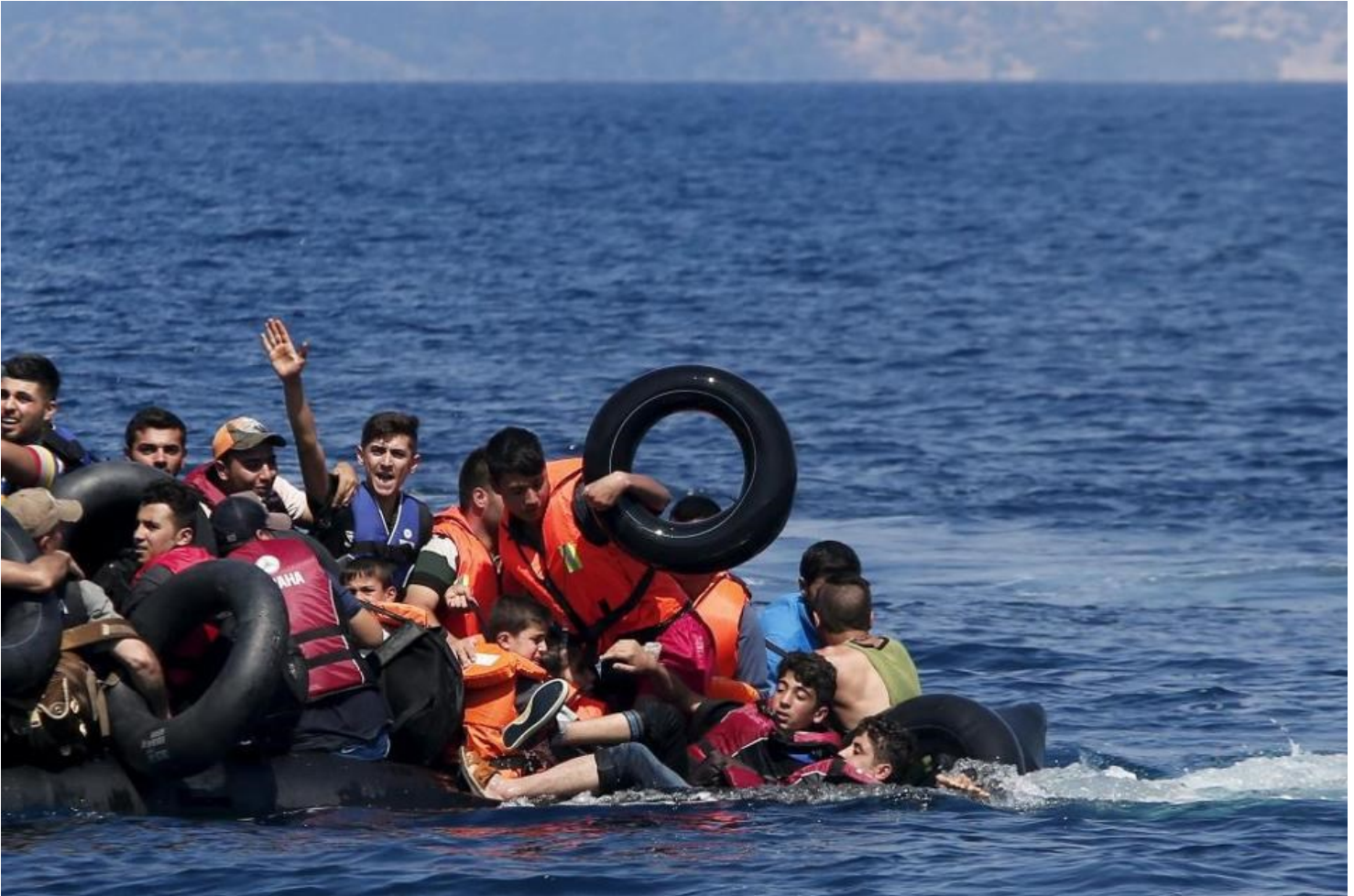
Syrian Refugees crossing from Turkey to Greece

Another powerful country, Russia is now actively involved in Syria. It is time to end the conflict before it is too late. Because, If this conflict continues, it will affect more countries in and outside of the region. The peace in the world will be seriously damaged. Therefore, it is time for UN Security Council and NATO members to act together. It is time NATO and Russia to combine their powers and bring peace to the region. There is no way that peace can arrive to region with the help of Jihadist opposition groups. We got enough lessons learned from the conflict in Afghanistan. There cant be an agreement with illegally armed or terrorist groups. International community should not rely on these groups to eliminate Assad regime. Because these illegally armed groups will turn into a dangerous enemy one day. Everyone should analyze how Taliban in Afghanistan was created and what is happening now. Free Syrian Army and Assad Regime should urgently declare cease fire and join forces against IS, Al-Nusra and other Islamic Jihadist groups. NATO countries need to support Russia to remove all Islamic jihadist groups from the region urgently. Once the region is cleared from these groups, then Syria can be rebuild, a transparent and democratic elections can be done and people of Syria can return their home. Otherwise, more people will continue to die in cold waters of Mediterranean and Aegean Seas.