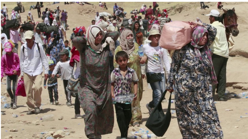
Escape from War in Syria

“There will be no end to the troubles of states, or of humanity itself, till philosophers become kings in this world, or till those we now call kings and rulers really and truly become philosophers, and political power and philosophy thus come into the same hands.” Plato