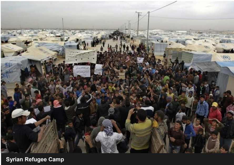
Syrian Refugee Camp